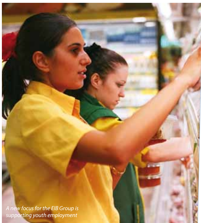
A new focus for the EIB Group is supporting youth employment