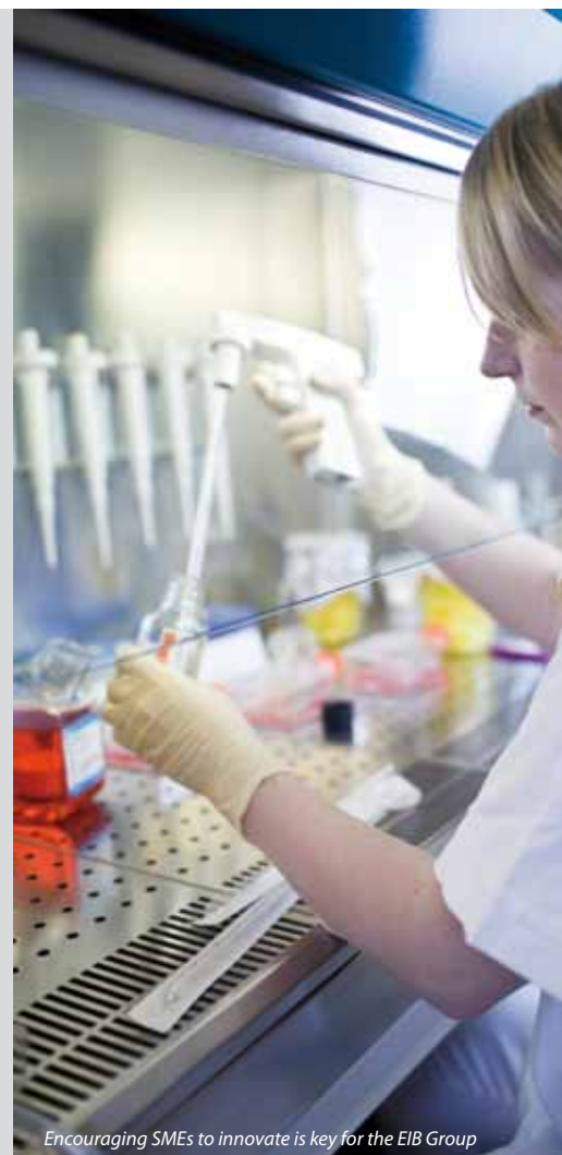
Encouraging SMEs to innovate is key for the EIB Group

Regional fund-of-fund schemes to provide equity finance to local SMEs in line with regional/national needs (managed by the EIF).