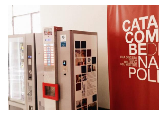
OFFICINA DEI TALENTI vending machine www.officinadeitalenti.com

The loan was made available under the social finance window of the JEREMIE Holding Fund Campania which aims at enhancing access to finance by lending to SMEs in order to provide loans for social improvement and social inclusion.