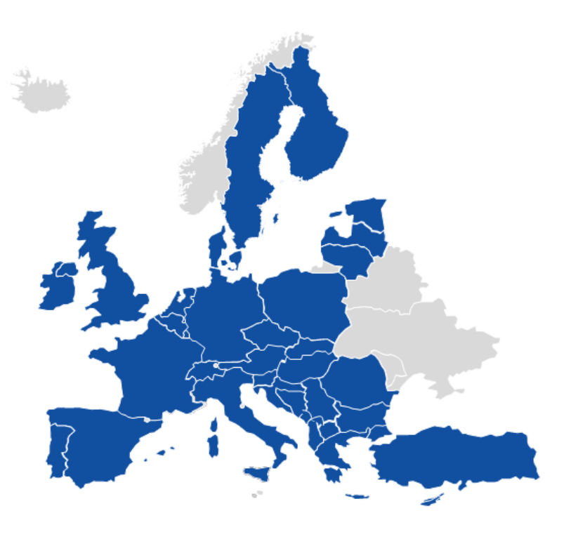
EIF signatures in 2015 (in blue)

Two different instruments define the operational framework of the SME Initiative: an uncapped portfolio guarantee facility under which financial intermediaries are covered against the credit risk of newly originated SME loans, leases and guarantees; and a securitisation instrument with the various parties involved. The SME Initiative has been successfully launched in Spain (expected to mobilise EUR 3.5bn of financing through six major Spanish banks) and in Malta. Other countries are in the pipeline.